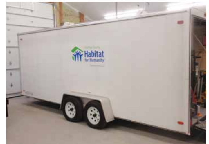
Trailer donated by the Glover family

In late summer, Pikes Peak Habitat for Humanity in Colorado Springs received a large tool donation from Home Depot during a sponsored workday when 700 employees